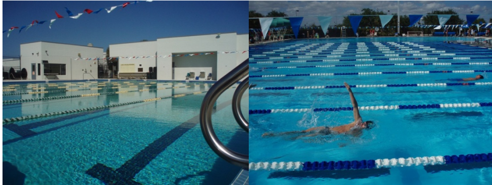
Sunrise Middle School, Fort Lauderdale

South Florida Masters/Triathlon Swim Camps, by Hammerhead Aquatics